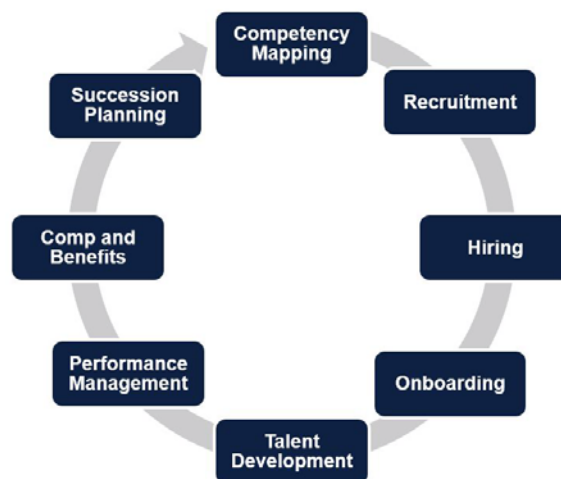
Fig. 1 Talent Vocational Education Management Network Structure System

In some higher vocational colleges, ideological and political education mainly uses inspiration and motivation to standardize students' behavior in daily learning, so that students can form correct values in a real sense. Fig. 1 is the network structure system of talent vocational education management.